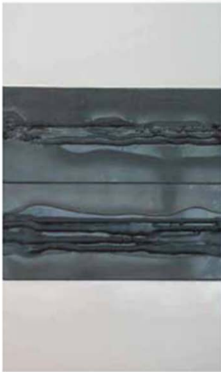
Texture White, 1600 x 1000mm, Resin